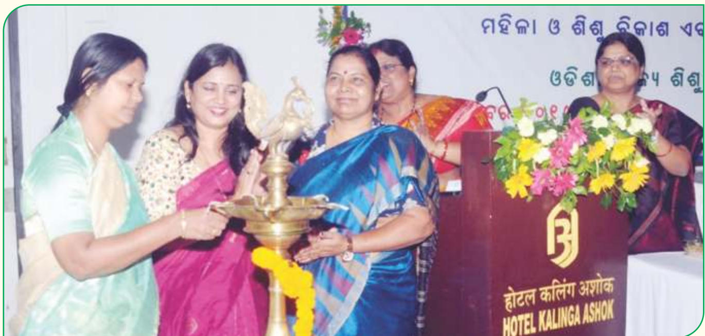
MS Tukuni Sahu Honourable minister, W & CD and MS innaugurating the function by lighting the lamp