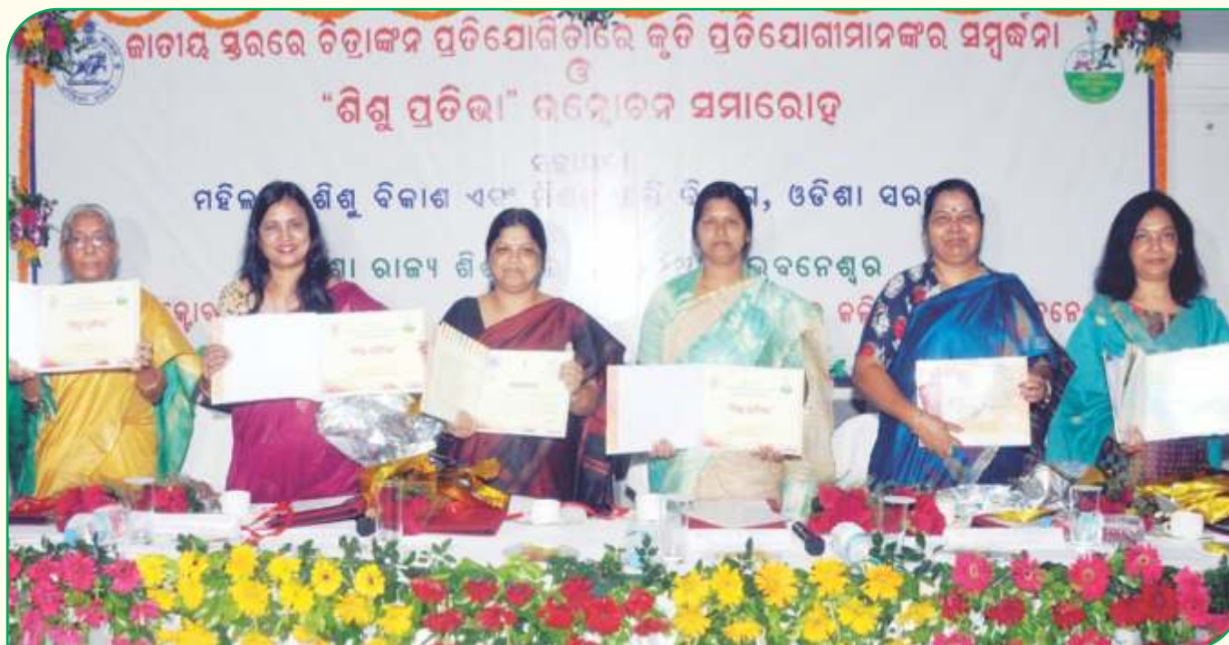
Inauguration of the album “Shishu Prativa” by the Hon'ble Minister, W & CD and MS

On this occasion the prize winners of national painting competition for the year 2013, 2015, 2016 and 2017 were felicitated with medals, certificates and cash award provided by Indian Council for Child Welfare, New Delhi.