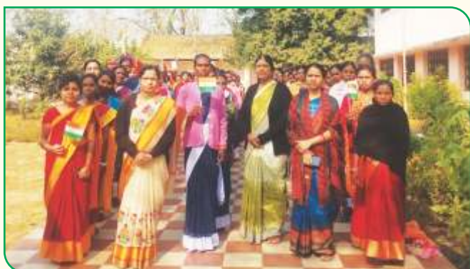
Observation of National Day by the AWTC