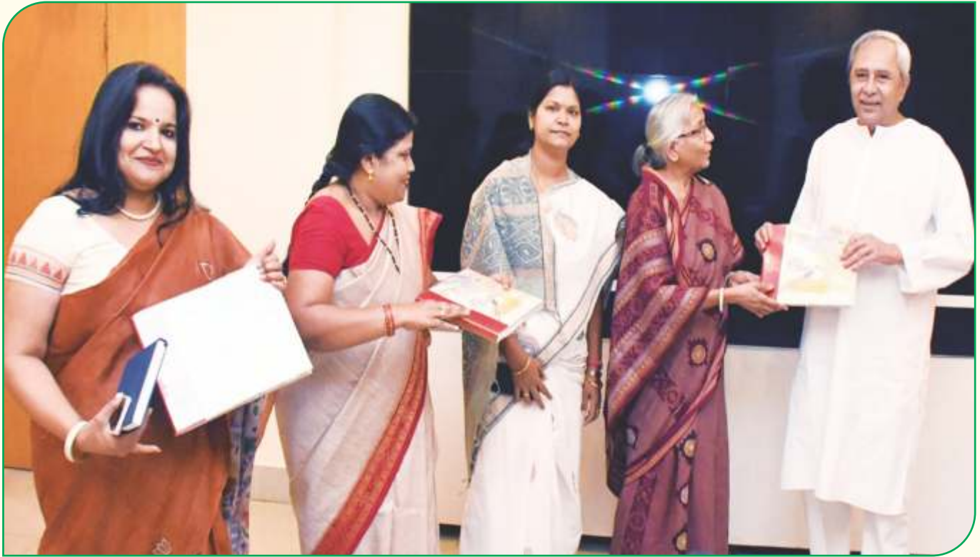
Hon'ble Chief Minister, Odisha with the Album "Sishu Prativa"