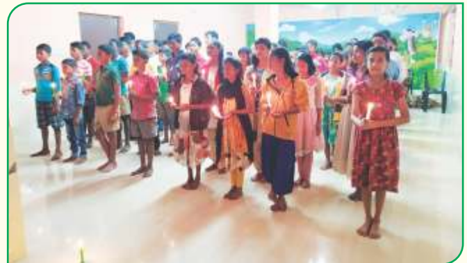
Observation of Christmas Day by the inmates of Utkal Balashram