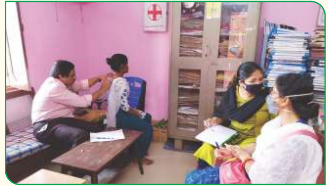
Health camp at Utkal Balashram