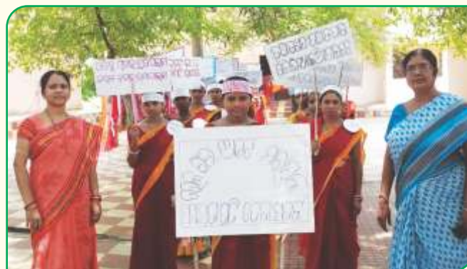
Campaign by AWW of AWTC