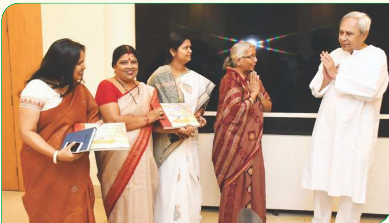
Member Secretary, OSCCW presenting the album " Shishu Prativa " to the Hon'ble Chief Minister, Odisha in the presence of Honourable Minister, W & CD and MS and Principal Secretary, Dept. of W & CD and MS