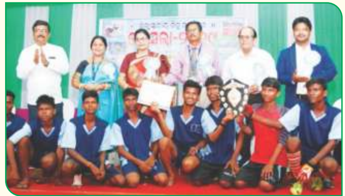
Achievement of inmates of Utkal Balashram in sports