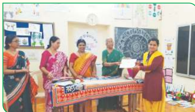
Distribution of certificate to the AWW by Member Secretary, OSCCW