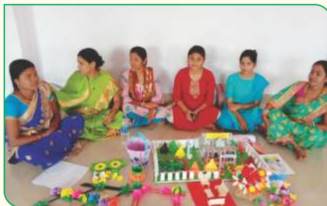
Demonstration of pre-school material by the trainees of AWTC