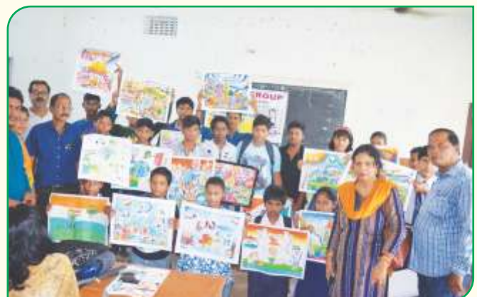
Children participating in the Painting Competition-2019