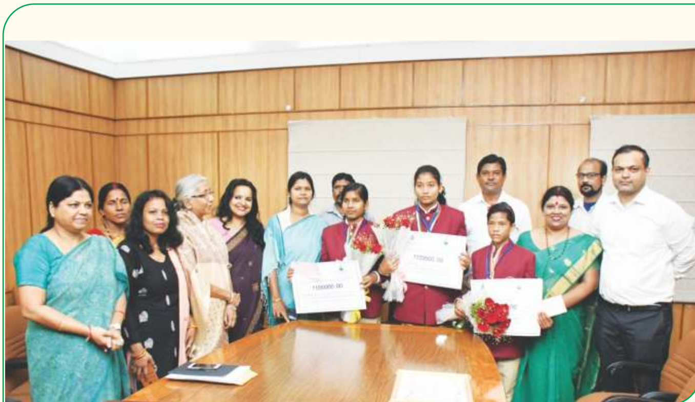
Winners of the National Award for Bravery for Children-2019 are felicitated by the Honourable Minister, W & CD and MS in the presence of Principal Secretary, Dept. of W & CD, Director, ICDS and Social Welfare and Member Secretary, OSCCW.