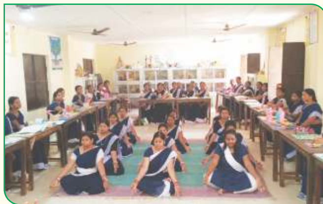
Demonstration of Nutrition practical & Yoga in the class room of AWTCs