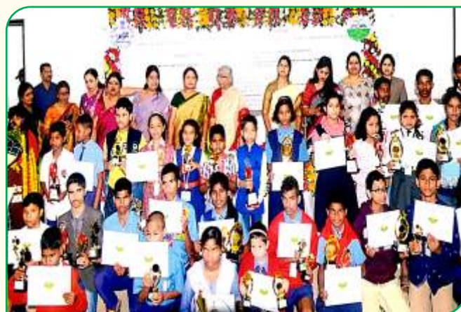
Felicitation of the winners nominated for National Painting Competition-2019