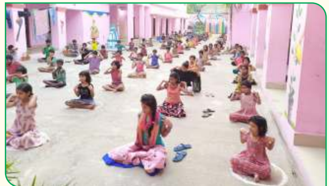
Yoga by inmates of Utkal Balashram during Covid-19