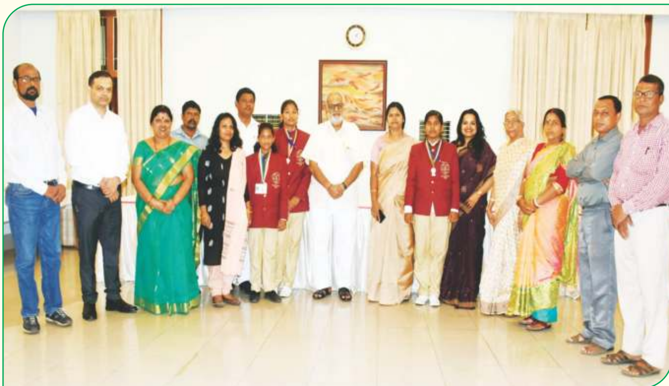
Winners of the National Award for Bravery for Children-2019 are felicitated by the Honourable Governor of Odisha in the presence of Honourable Minister, W & CD and MS, Principal Secretary, Dept. of W & CD, Director, ICDS and Social Welfare and Member Secretary, OSCCW.