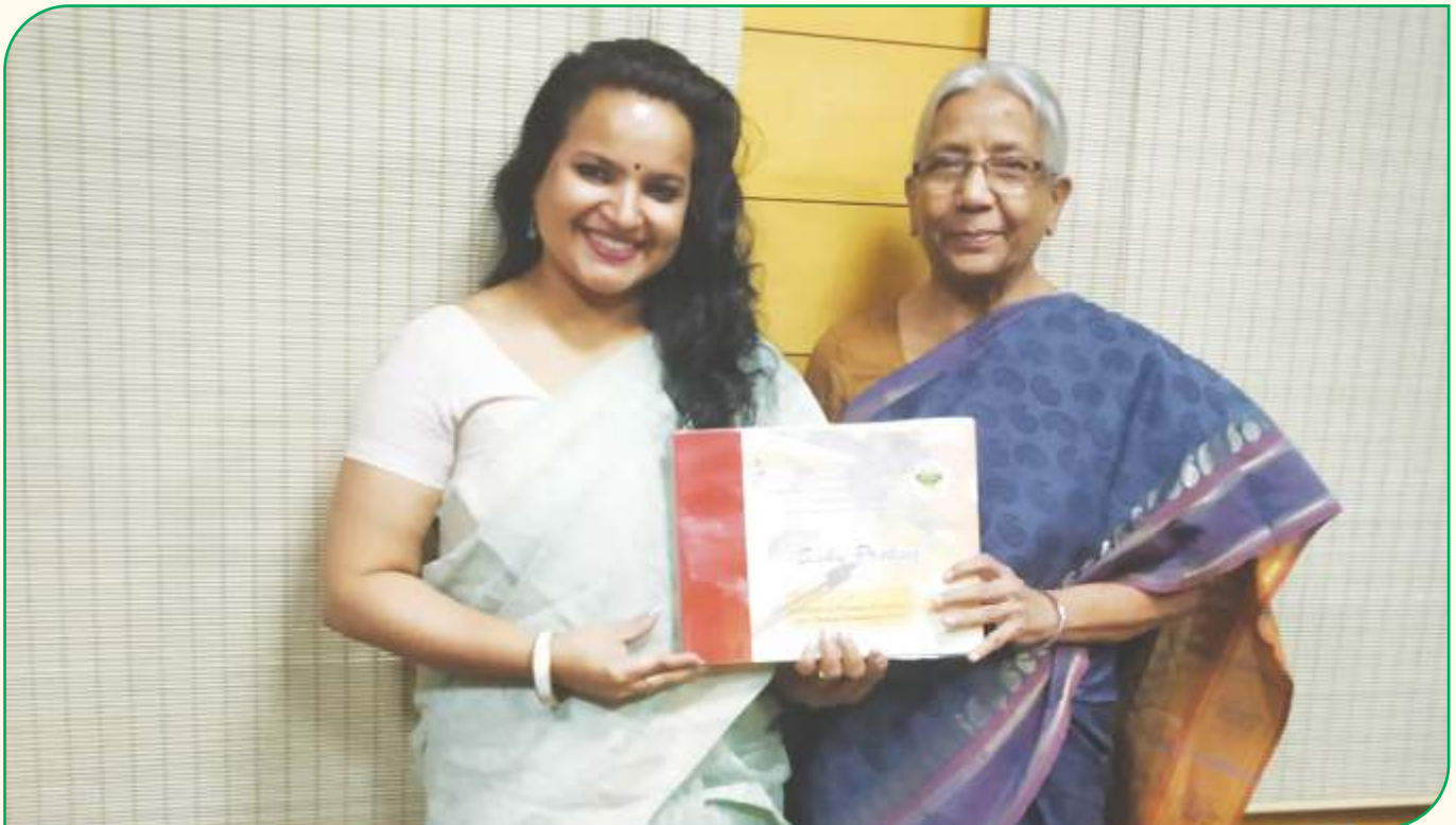
Principal Secretary, Dept. W & CD and MS with the Album "Sishu Prativa"