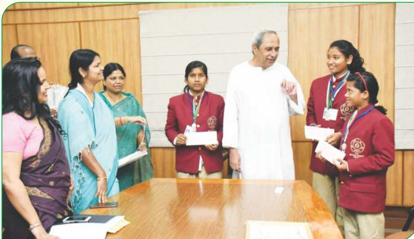
Honourable Chief Minister of Odisha felicitating the Winners of the National Award for Bravery for Children-2019 in the presence of Honourable Minister, W & CD and MS and Principal Secretary, Dept. of W & CD