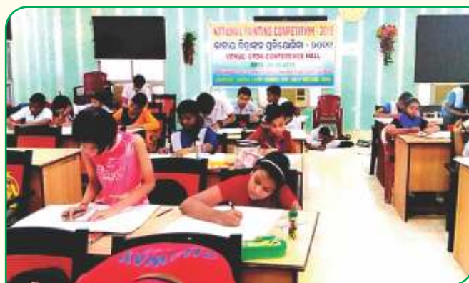
Children participating in the Painting Competition-2019