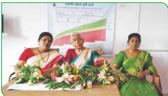
Visit to AWTC Dhenkanal & Berhampur by Member Secretary & CWO, OSCCW