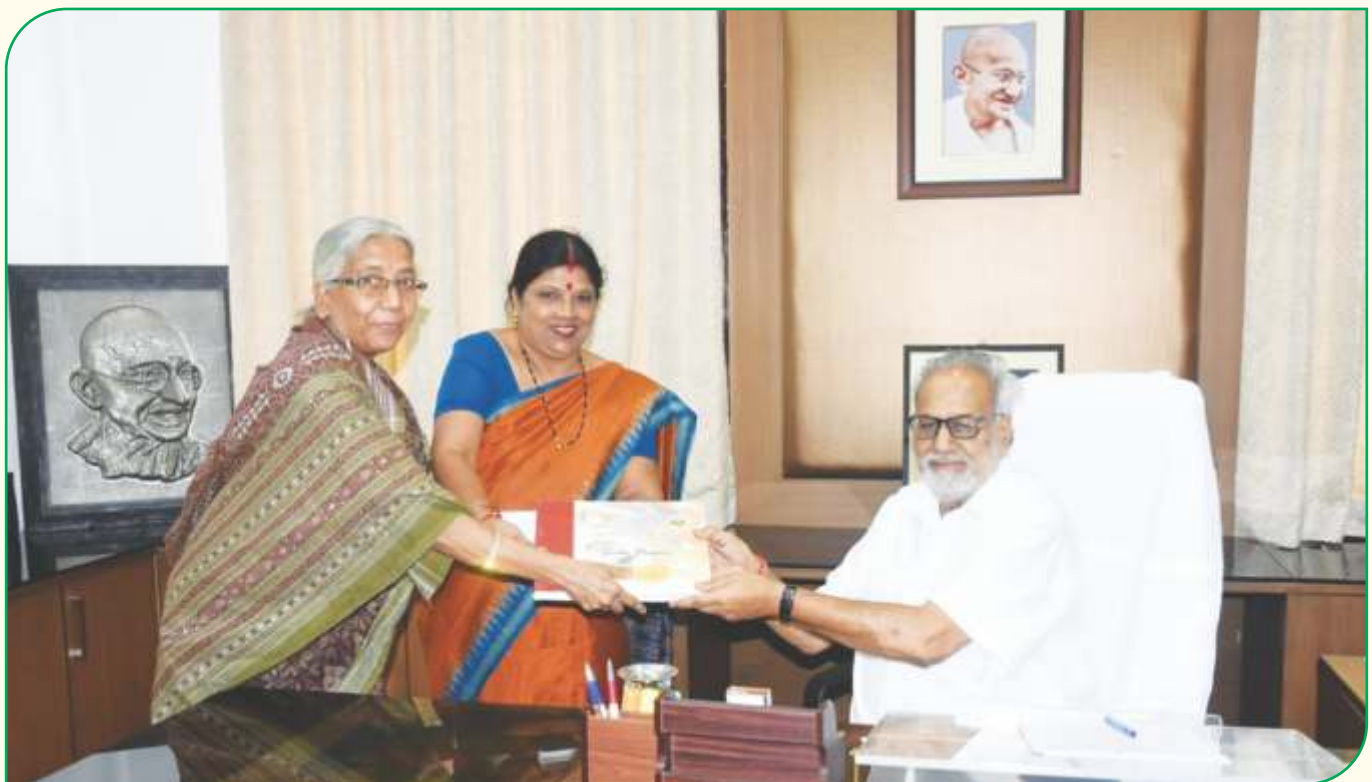
Member Secretary, OSCCW presenting the album “ Shishu Prativa ” to the Hon'ble Governor, Odisha.