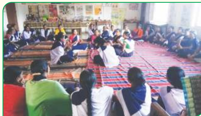
Role play activities by the AWHs