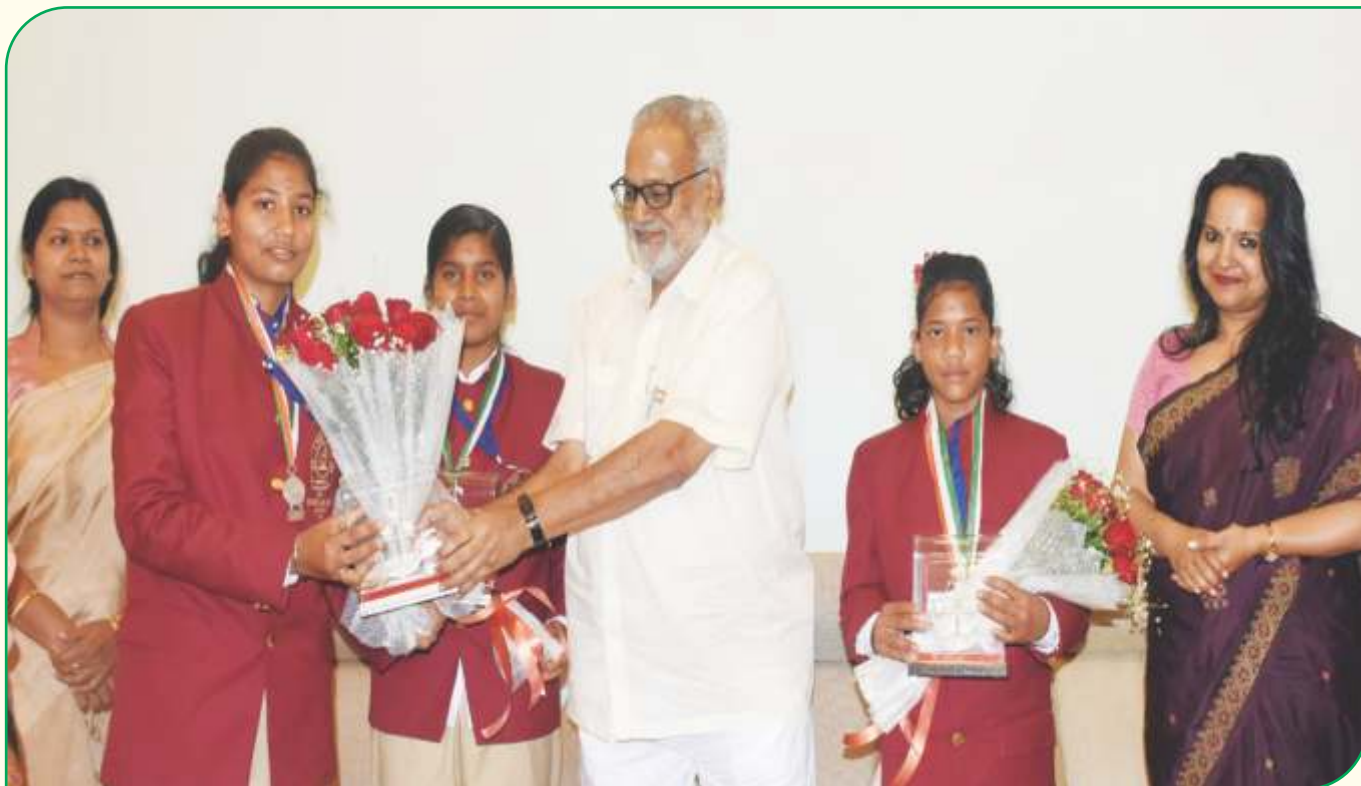
Felicitations of the winners of National Award for Bravery for Children-2019 by the Honourable Governor of Odisha