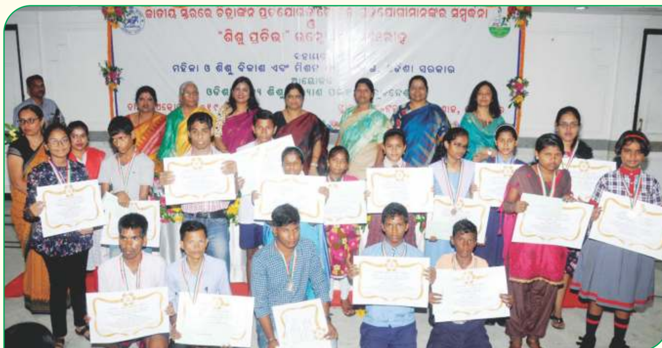
Felicitation of the winners of National Painting Competition by the Honourable Minister, W & CD and MS, Govt of Odisha in the presence of Member Secretary, OSCCW

On this occasion the prize winners of national painting competition for the year 2013, 2015, 2016 and 2017 were felicitated with medals, certificates and cash award provided by Indian Council for Child Welfare, New Delhi.