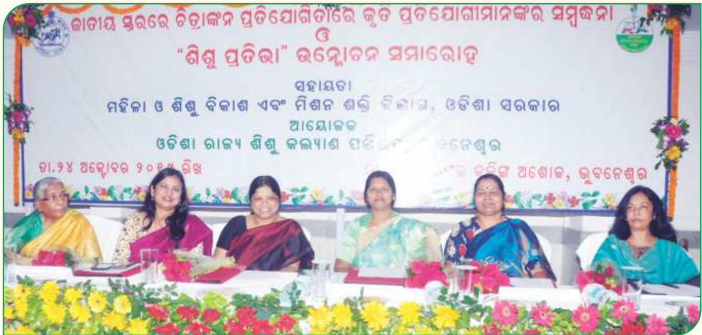
Guests on the dais at the inaugural ceremony of the Album “Shishu Prativa”

An Album “Shishu Prativa” containing all paintings selected and recommended for National level selection and best adjudged paintings at the district level was prepared and released on 24.10.2019 by the Hon'ble Minister, Women & Child Development and Mission Shakti at Hotel Kalinga Ashok.