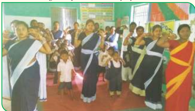
Yoga by Anganwadi Helpers