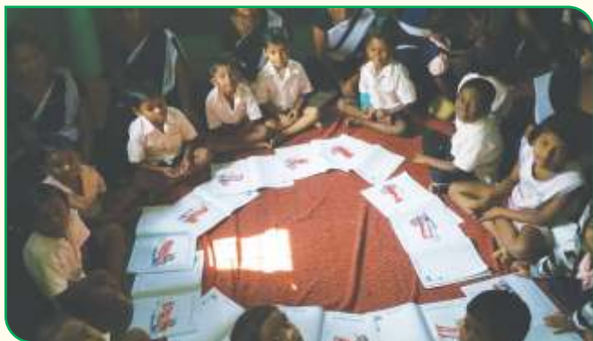
Pre-school activities by the children in the Anganwadi during field placement study by the AWH